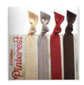
FOUR SOLID 5/8" HAIR TIE ON A CUSTOM PRINTED CARD ATS-S4 • INSIDE A CELLO ENVELOPE

RETAIL PRICE INCLUDES SET-UP CHARGES, PMS COLOR MATCH, AND ART FEES