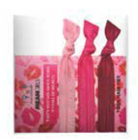
THREE SOLID 5/8" HAIR TIE ON A CUSTOM PRINTED CARD ATS-S3 • INSIDE A CELLO ENVELOPE

RETAIL PRICE INCLUDES SET-UP CHARGES, PMS COLOR MATCH, AND ART FEES